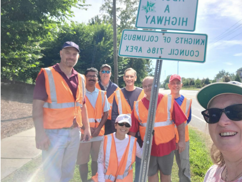
Knights of Columbus Adopt a Highway Cleanup Olive Chapel Road