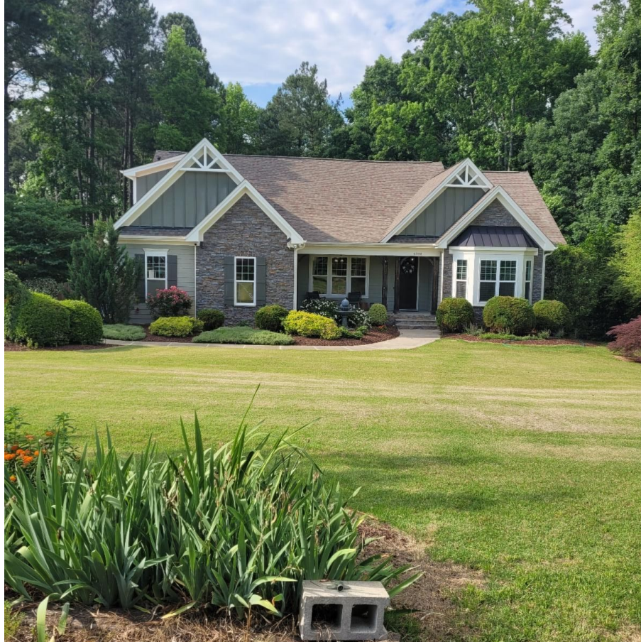
The new rectory for 2 priests, seminarian and guest room. 6300 Apex Barbeque Road, Apex, NC 27502