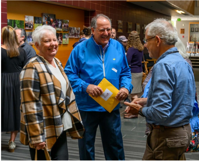
Newcomer Welcome Luncheon on October 27th