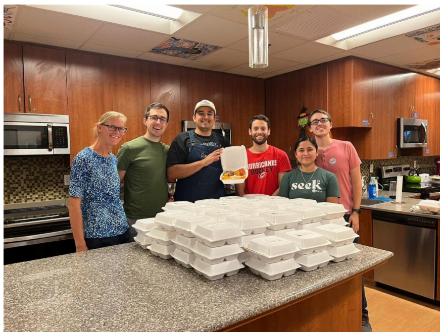
The Frassati Young Adult Group made dinner at the Ronald McDonald House in Durham! To learn more about our group, email frassati@stmm.net .