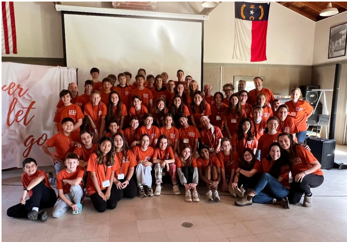
Over 50 Middle Schoolers on the Edge Retreat last weekend